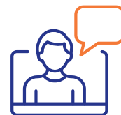
Access To Training Courses & Events

*Gold or Platinum Plan required, please contact your regional sales contact for more information