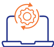
Software & Firmware Updates